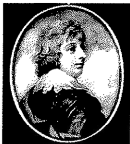
Richard Cosway, William Courtenay

Exeter's Royal Albert Memorial Museum has recently acquired the miniature of William Courtenay painted by Richard Cosway in 1793. The portrait is painted in watercolour on ivory and includes an unidentified sealed lock of hair. It is an appropriate purchase for the Exeter museum, as Cosway was born locally at Tiverton and Courtenay was one of the artist's most important patrons.