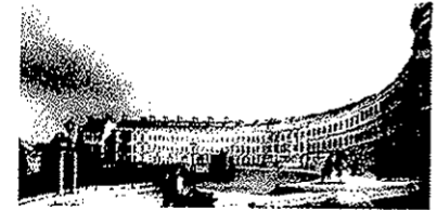
Lansdown Crescent, 1828

Those who missed the chance to visit Beckford's Grecian Library in June will have another opportunity on Sunday 7 November.