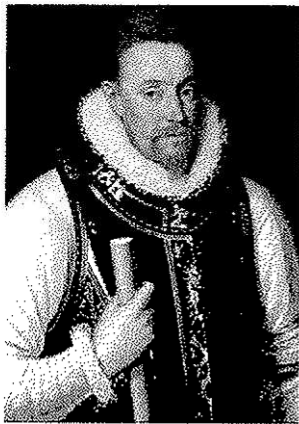
Flemish School 16 th Century, A Knight of the Golden Fleece

Watercolours once in Beckford's collection by John Robert Cozens were offered at Sotheby's on 14 July. The stupendous The Lake of Albano and Castel Gandolfo fetched £2,393,250. And a copy of Edmund English's Views of Lansdown Tower (1844) with illustrations by Willes Maddox made £3,750.