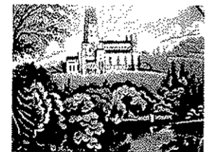
Fonthill Abbey as depicted on a blue & white plate

The note on Vathek was: Beckford's oriental despot and his companions discover an underworld palace, where 'the payment, strewn with gold dust and saffron, exhaled so subtle an odour as almost overpowered them'. 'A throng of Genii and other fantastic spirits of each sex danced in troops, at the sound of music which issued from beneath'. Nice they think. But this is Hell, where they will be 'prey to grief without end'.