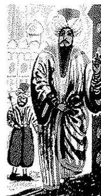
Edward Bawden, Vathek , 1958