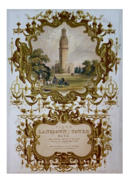
Edmund English, Views of Lansdown Tower, Bath, 1844