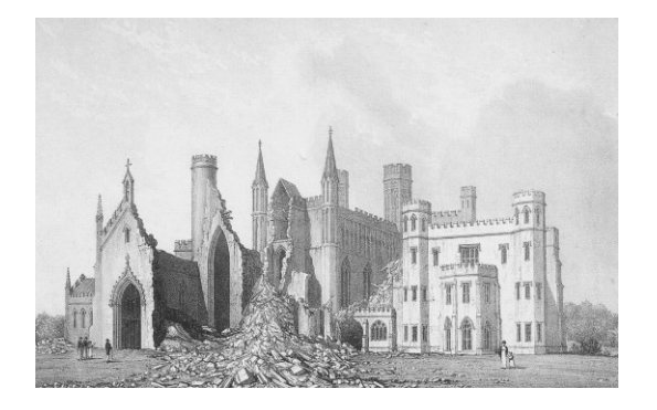
Ruins of Fonthill Abbey

RECOVERING FONTHILL 1560-2014 A SYMPOSIUM