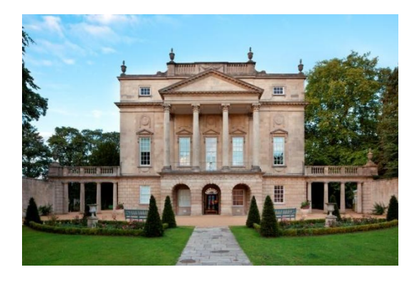
The Holburne Museum

This year's Annual General Meeting will be held at the Holburne Museum, Bath on Saturday 31 May.