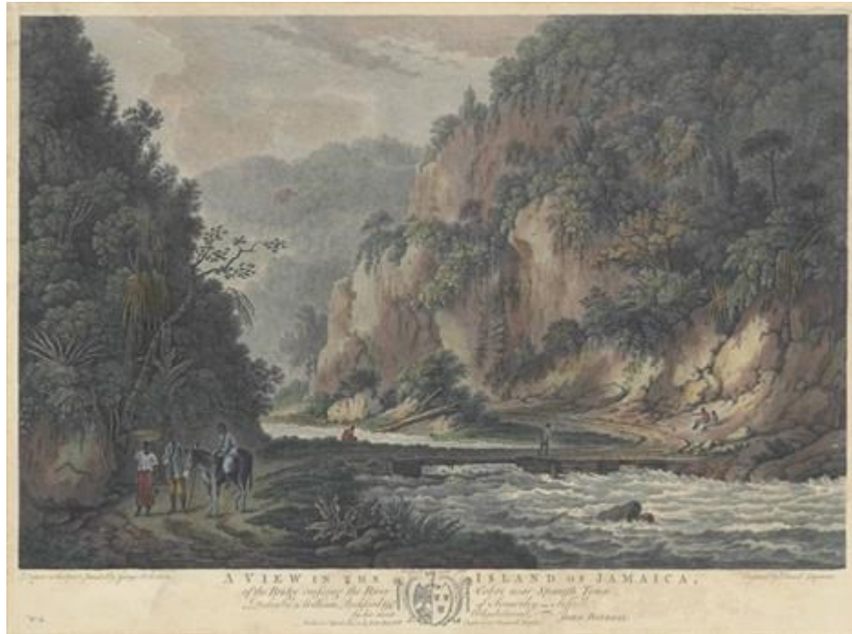
The Bridge crossing the River Cobre near Spanish Town