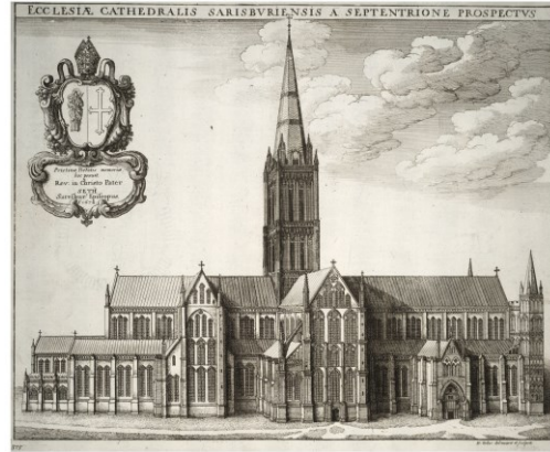
Wenceslaus Hollar, Salisbury Cathedral

Next year's AGM will take place in Salisbury on Saturday 6 June. We have chosen this city for our venue as it will give members an opportunity to see the Turner exhibition (see next page).