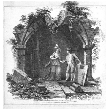
From The Castle of Otranto , 1765

This autumn, the British Library is presenting Terror and Wonder: The Gothic Imagination a major exhibition of Gothic literature to mark the 250 years since Horace Walpole's Castle of Otranto was published. It will celebrate many literary masterpieces produced in Britain since, as well as modern interpretations of the Gothic in popular culture today. Paintings by Henry Fuselli, William Blake and Philip James de Louthembourg will be included.