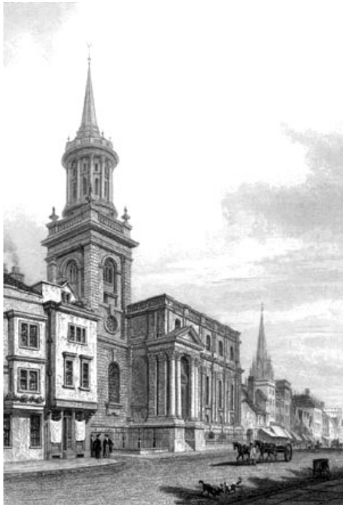
All Saints Church, 1834

Participants will then be free for lunch, which can be taken in the Weston Library's café or in any of the famous pubs and eating places nearby. Some might even succumb to the temptations of Blackwell's bookshop or the Ashmolean Museum.