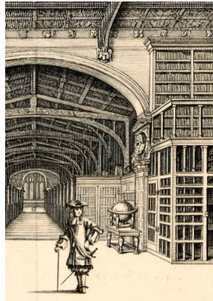
Bodleian Library from Loggan, Oxonia Illustrata , 1675.

We have contemplated an Oxford visit to see the Beckford Papers for some time, but this has been delayed in recent years by the transformation of the New Bodleian into the stunning Weston Library, which opened to the public last year.