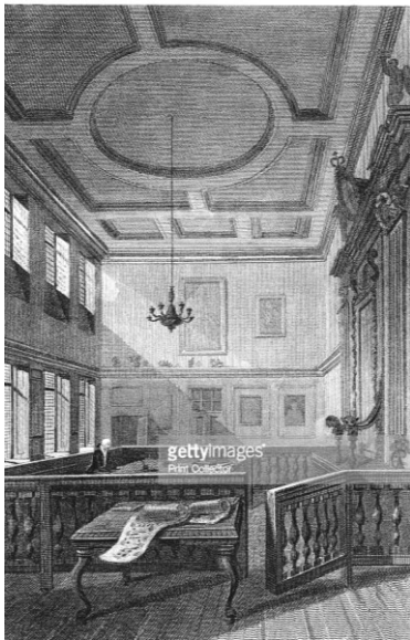
Court Room, College of Arms, 1816

This year's AGM on Saturday 11 June, will be held at Dr Johnson's House in the City of London. It was here that Samuel Johnson lived 1746 – 39 whilst compiling his great Dictionary of the English Language .